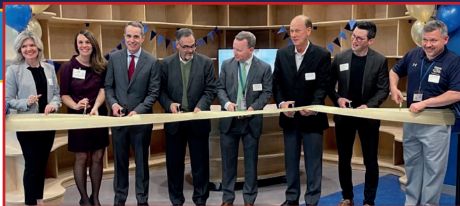
▲ I was happy to help cut the ribbon on New Hope-Solebury High School's brand-new STEAM Wing. This state-of-the-art facility will provide students with the opportunity to excel in skills relating to engineering, media, robotics, technology, and more.