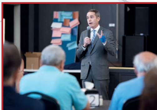
▲ Central Bucks Senior Activity Center hosted my April Legislative Coffee & Conversation where we had a packed house of constituents who came out to talk about the issues most important to them.