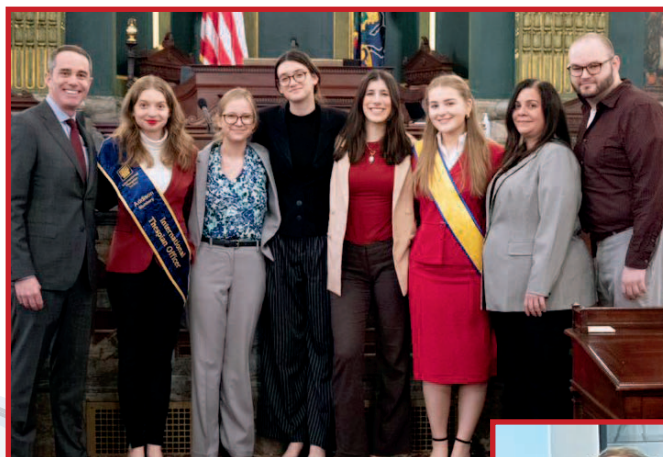
◀ In recognition of Theater in Our Schools Month this March, I hosted students and staff from Pennsbury's Thespian Troupe 830 in Harrisburg.