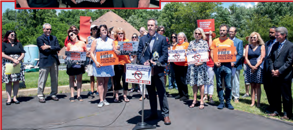
▼ At my June press conference with community leaders and concerned citizens to talk about SB 1300.