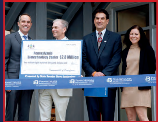
At the PA Biotech Center ribbon cutting celebration in May.