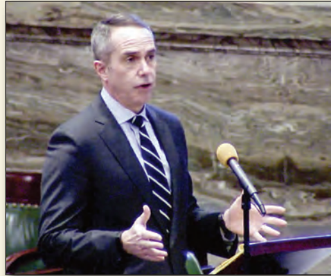
Senator Santarsiero speaks from the floor of the Senate during an Appropriations Committee Budget Hearing.