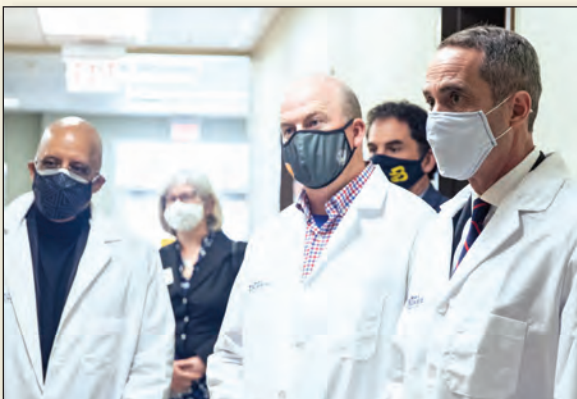
Senator Santarsiero hosts leadership of House and Senate Appropriations Committees for tour of the Pennsylvania Biotechnology Center in Buckingham, PA.