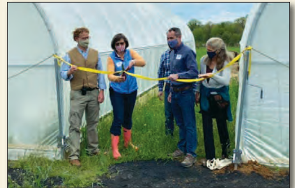
Senator Santarsiero (second from right) at the ribbon cutting for two new greenhouses at Snipes Farm and Education Center in Falls Township.