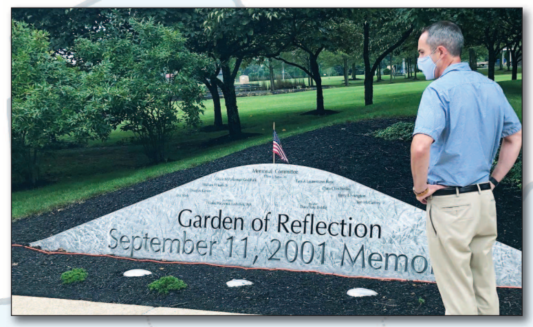
Sen. Santarsiero visiting the Garden of Reflection Memorial in Lower Makefield Township on the morning of September 11 to pay tribute to those who lost their lives.