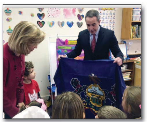
Sen. Santarsiero presenting a state flag at First Friends Childcare Center in New Britain, celebrating 31 years of child care services. ( Pre-pandemic )