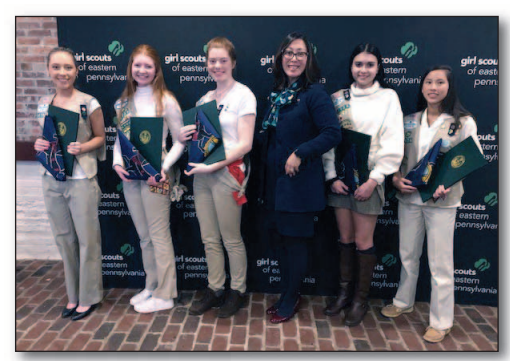
Girl Scouts Gold Award recipients with their congratulatory Senate citations and state flags. ( Pre-pandemic )