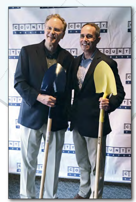
After providing support for the application for the Keystone Historic Preservation grant program, Sen. Santarsiero was on site for the groundbreaking for The County Theater's restoration and expansion project, the biggest undertaking the theater has experienced in its 81-year history.