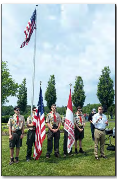
The Central Bucks Rotary's Ride for the Heroes drew more than 300 riders and raised over $40,000 for wounded veterans and the families of fallen heroes.