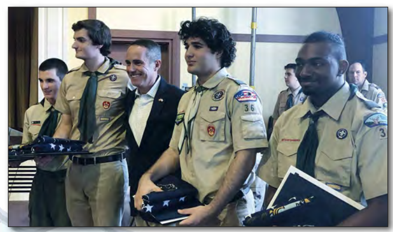
Sen. Santarsiero joined Troop 36 for the Boy Scout Court of Honor commemorating their four newest Eagle Scouts. This year Sen. Santarsiero has honored more than 50 Eagle Scouts.