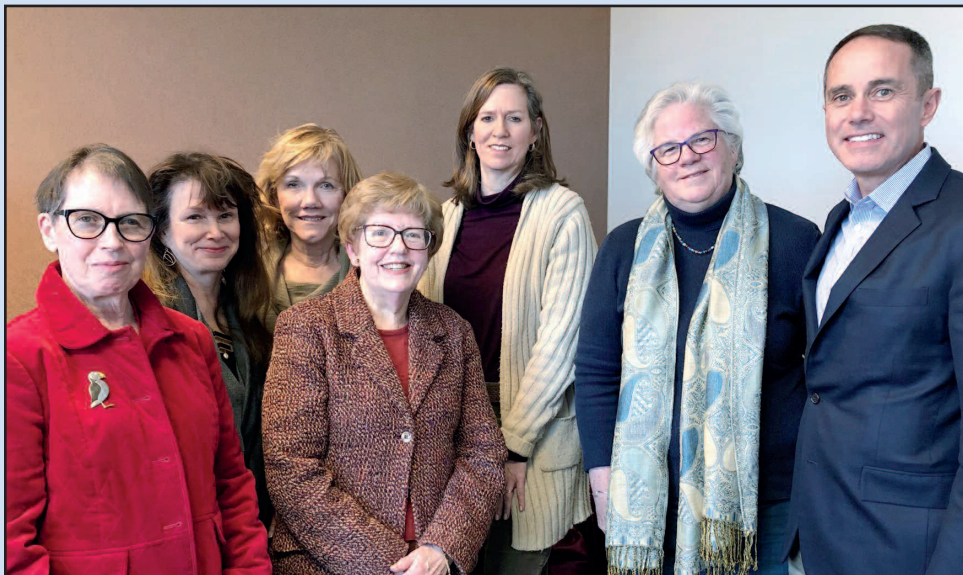
Senator Santarsiero meeting with members of the Bucks County Women's Advocacy Coalition.