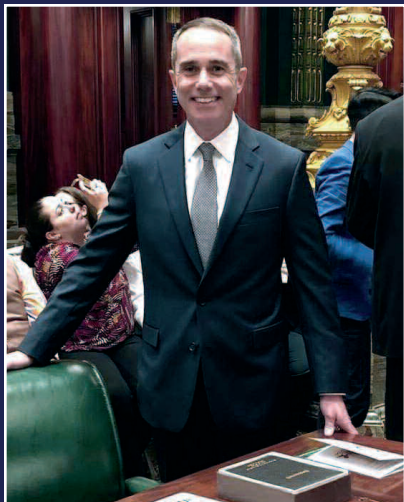
State Senator STEVE SANTARSIERO