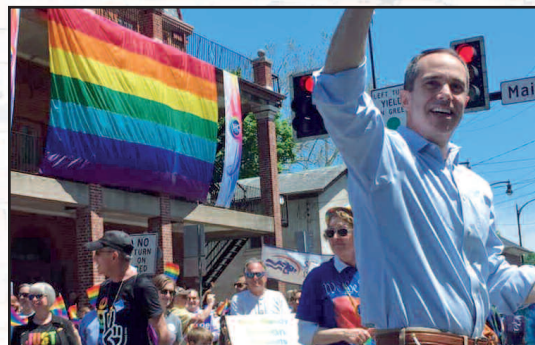
It was a great day at the New Hope Celebrates Pride Parade.