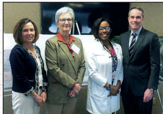
The doctors, nurses, support staff, and administrators of Grand View Health in Sellersville provide critically important medical services to the residents of Bucks and Montgomery Counties. I fully support their plan to build a state-of-the-art cancer center so that patients can access these life-saving treatment close to home.